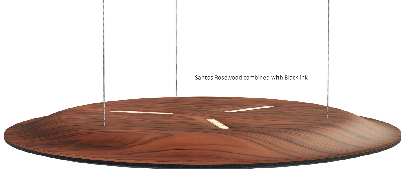
Santos Rosewood combined with Black ink